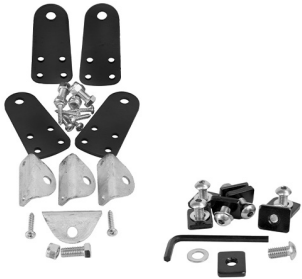
Hardware Kit (1)