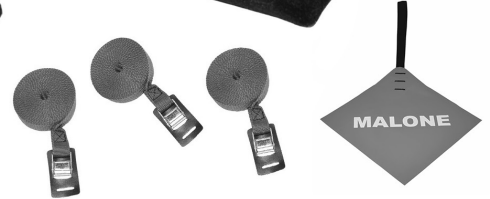
Safety Flag (1)